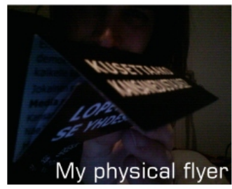
My physical flyer

First glance to flyer gives out only an question, argument, wish or image that fits political trends, ideological views or cultural cohesion that supposed target group holds, nothing more.